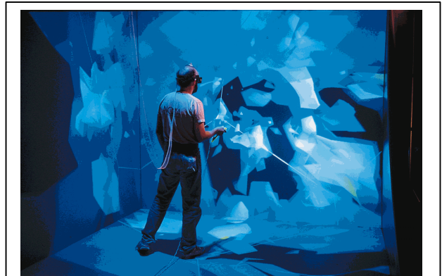
Figure 1: EVL has developed several VR projection-based displays, most notably the CAVE

scientists to collect, maintain, develop, distribute, and