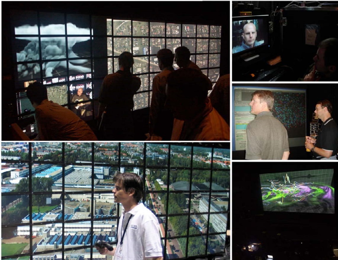
Figure 1: Top Left: SAGE showing several high resolution streams (high-definition thunderstorm simulation; high-definition live video; ultra-high-resolution aerial photography of New Orleans after the Katrina Hurricane) simultaneously on the LambdaVision display; Bottom Left: TOPS showing a single high resolution montage of Amsterdam; Top Right: Autostereoscopic video conferencing on the Varrier display; Middle Right: Solutions Server streaming graphics to a passive stereo XGA resolution display; Bottom Right: BPlayer streaming high-definition stereo movies to a high-definition passive stereo display.

Realising a persistent, robust GLVF provides us the opportunity to conduct thorough testing of these concepts on real network testbeds at a variety of distances, and enables us to guarantee that the developed solutions are compatible internationally.