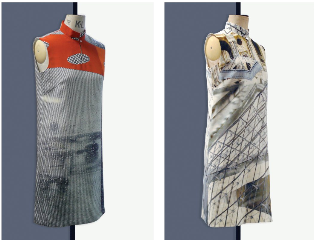
Third Skin. © 2011 Andrea Zapp.

artwork. The virtual space is framed as the other place of memory and home by capturing it in analogue paraphernalia, modeled on and manufactured from the digital. Craft and media design objects and artifacts render the digital space domestic and decorative, but with the intention of provoking a surreal and paradoxical sense of longing and belonging to a parallel world. As Zapp suggests, “the idea of a digital habitat, a shared environment, is the main driving narrative in my installations, down to the actual physical architecture in many of my earlier works resembling physical living spaces, hotels, houses, and private webcam scenarios to create related metaphors.”