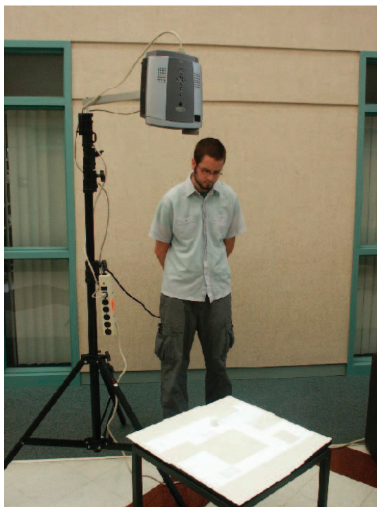
2 StorySpace table, projector, and stand.

into our everyday lives, specializing those devices to make their use minimally disruptive, and often miniaturizing them to make them portable and accessible. StorySpace's media collection devices exploit this technology to take learning out of the classroom and into students' communities and personal lives.