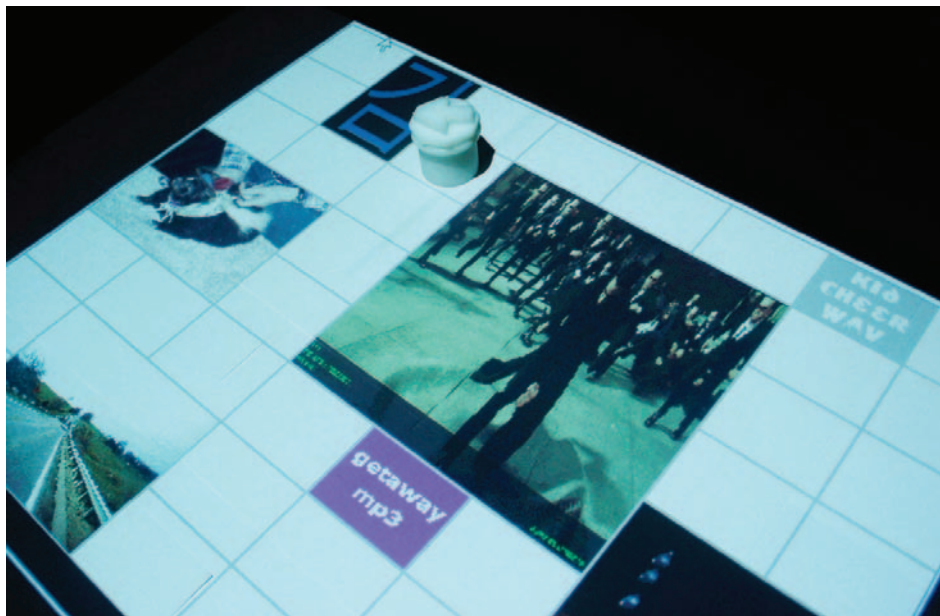
1 Close up of the StorySpace board in its design mode.

StorySpace was inspired by research in both tangible and ubiquitous interfaces. Tangible user interfaces 1 embed the human-computer interface in physical objects, exploiting the natural spatial abilities of their users and opening not only visual but also physical communication paths. The StorySpace board has much in common with these interfaces. Ubiquitous user interfaces 2 stress the embedding of computational devices