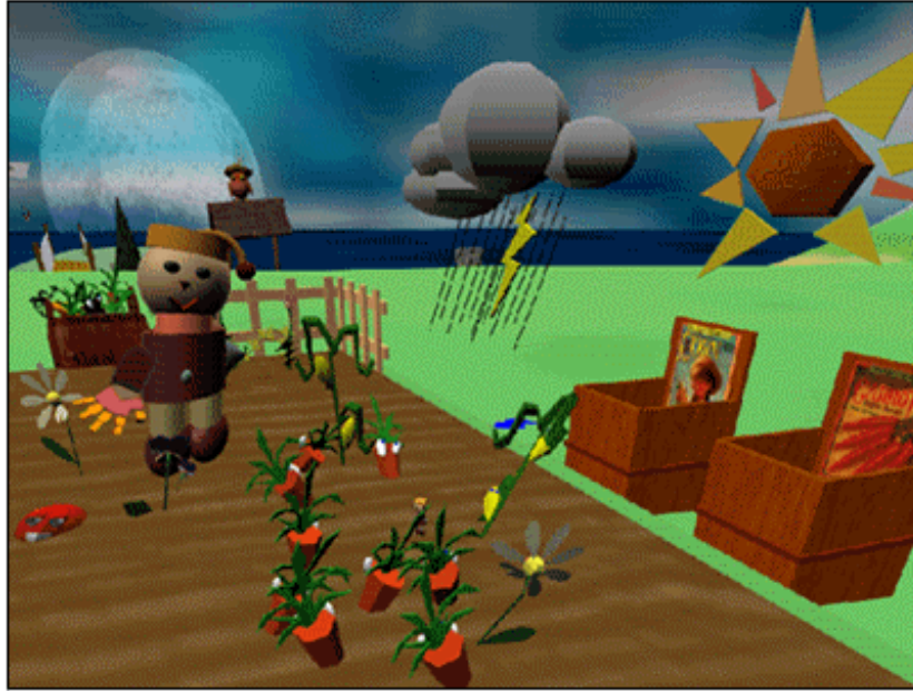
Figure 1: Jim, represented by an avatar, plants carrots in the NICE garden

As the CAVE supports multiple simultaneous physical users, a number of children can participate in the learning activities at the same time. All users wear special lightweight glasses, which allow them to see both the virtual and the physical world unobtrusively. Using a light-weight hand-held device for interaction, the children may plant, grow, and pick vegetables and flowers, climb over objects, leap in the air, shrink to observe the root system of their plants, or change the flow of time. Familiar methods of interaction are employed, which eliminate the use of menus and instead use simple visual metaphors. The children can thus water their plants by pulling a raincloud over them, provide sunlight with the use of the sun, or clear the garden weeds by recycling them in the compost heap. Such symbolic representations of the various environmental elements are used to facilitate the learner's understanding of complex ecological interrelationships. When the raincloud has been over a plant for too long, the plant will hold up an umbrella, thus providing direct feedback to the child.