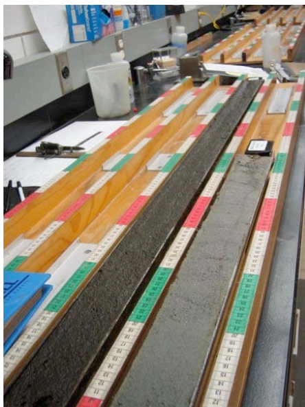
Figure 3. Split cores ready for initial core description on the core table

multi-sensor core logging equipment to acquire digitized core data. He also attempted to do the initial visual core description as a real geologist on the core table (Figure 3).