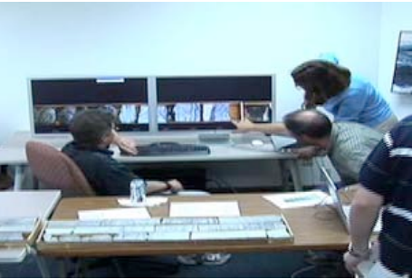
Figure 5. CoreWall Setups in National Lacustrine Core Repository (LacCore, above) and Antarctica Geological Drilling (below)