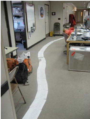
Figure 2. Before having the CoreWall system, scientists use barrel sheets to look at collected data. This picture shows hand-drawn clast core description for 1,000 meters of cores recovered in Antarctica in 2006.