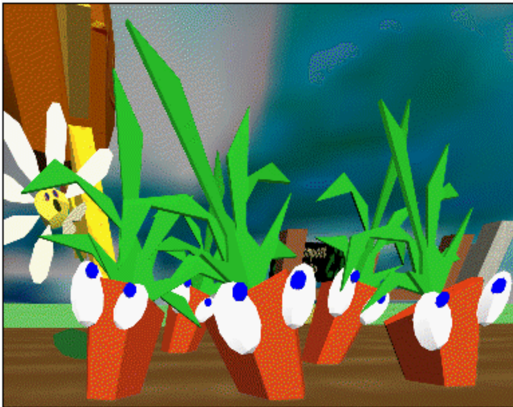
Figure 2: Becoming small in the carrot garden.

All the objects, avatars and genies in the world are VRML models, which can be moved and scaled by the child in real time. The plants, trees, and flowers are simple agents with common rules of evolution and behaviour which are based on simplified ecological models. They contain a common set of characteristics that contribute to their growth, such as their age, the amount of water and sunlight they need, and their proximity to other plants. The combination of these attributes determines the health of each plant and its size. As soon as Amy drops the carrot seed on the ground, the carrot will start to grow. When she pulls the cloud over to water it, the carrot will grow faster. Visual and audio cues aid the children in determining the state of each plant or flower. The carrot will pop up a small animated umbrella to let Amy know that it doesn't require any more water. These models are handled by a central behavioural server called LIFE, which also controls the actions of the genies and story structures. LIFE can be operating constantly on any centrally located computer thus maintaining a persistent virtual world [Fig. 4].