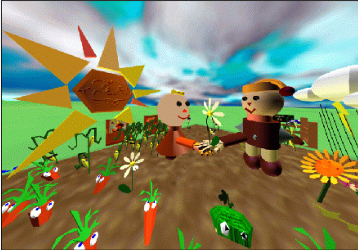
Figure 1: Children, represented by avatars, plant a NICE garden.