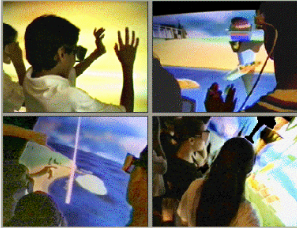
Figure 5: Children interacting with the NICE world.

Although the cost and size of the CAVE, or even smaller VR technologies prohibits their use in today's classroom, it will not be long before the networked and technology-rich classroom becomes a reality. As the technology continuously decreases in cost and increases in power, more museums and cultural centers are beginning to acquire multi-user VR systems which allow for many children to participate in the experience at once.