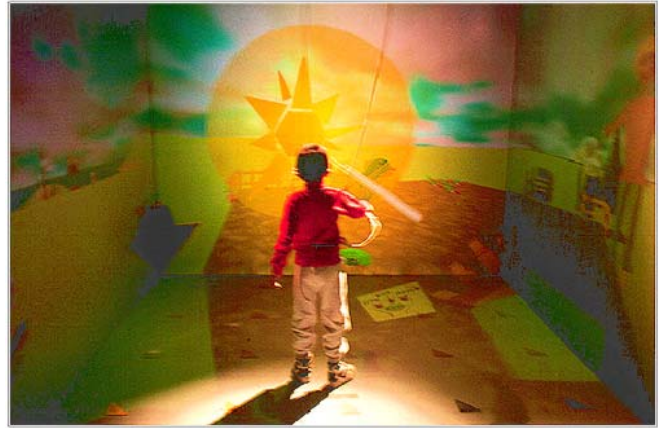
Figure 1: The CAVE - one of several VR projection-based displays that EVL has developed

CAVERN, the CAVE Research Network, is an alliance of industrial and research institutions equipped with CAVEs, Immersadesks, and high performance computing resources, interconnected by high-speed networks to support collaboration in design, training, education, scientific visualization, and computational steering, in virtual reality. Supported by advanced networking on both the national and international level, the CAVE research network is focusing on Tele-Immersion - the union of networked virtual reality and video in the context of significant computing and data mining.