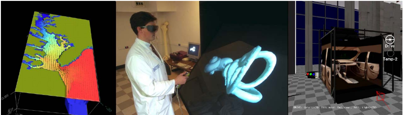
Figure 4: Three current tele-immersive projects: scientific visualization with CAVE-5D, medical education with the virtual temporal bone, and design review with GM's visualey

gies were identified as common to the future use of the NGI [14]: Database Access, Audio and Video, Real-Time and Delayed Collaboration, Distributed Computing, and Tele-Immersion.