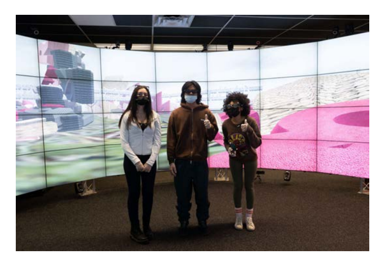
Screencap of the completed walkthrough, a very fun experience overall!

Overall, we wanted to have a fully immersive experience for users to be able to see the direct impact that their consumption habits have on the planet. Consumers are able to see something as close to a first-hand experience. By incorporating smaller more manageable solutions within the walkthrough, we hoped to make improvements in consumer habits more accessible to the average person, giving them to at least take some small actions rather than giving an overtly generalized statement that could be brushed off as soon as they get home. Some things that we would go back to develop further are the environment as a whole and the sound effects that were featured throughout. We believe that we could continue to make better design decisions to fully represent the mucky environment with additional colors and textures that were grimmer and having the industrial sounds more persistent throughout the entire walkthrough. Nonetheless, we are extremely proud of the way it turned out and have noticed that we are also more conscious of our decisions when we choose to participate in consuming textiles.