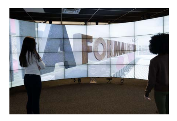
4.2 Up close view of forms and textures applied to the text.

the environment while the other was a decision that is a good consumer habit that leads to helping break consumer habits that continue to poison our world. Going through the negative door causes a landfill of the textile type to fall from the sky. The other door plays a charming sound that indicates it positively supports the player's decision. It's tough to understand and see how as consumers our choices have a correlation and impact on our world as in most situations we don't instantly see our consequences. But with the interaction, we see it right away when a bad decision is made.