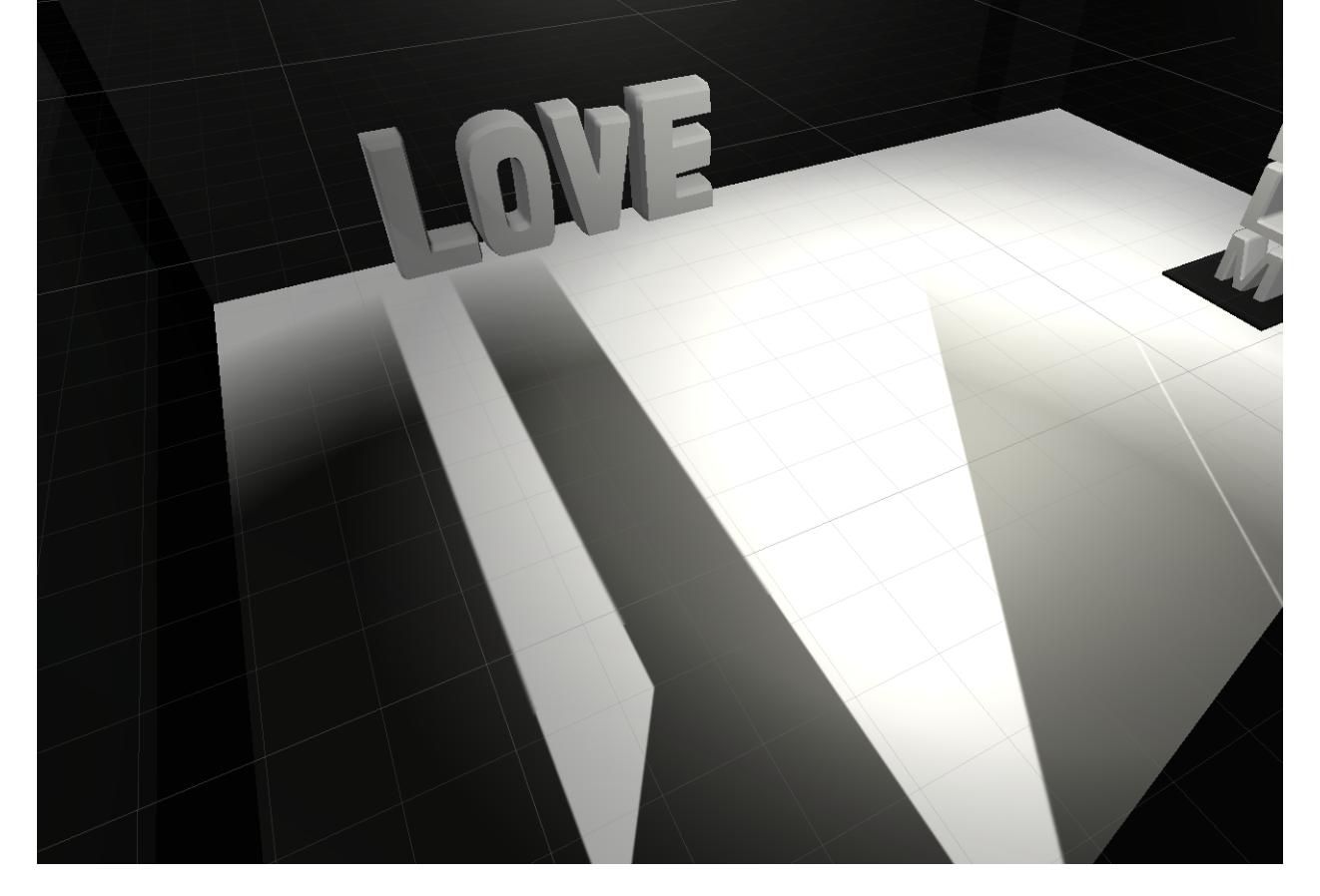
This is the end point of the scene.