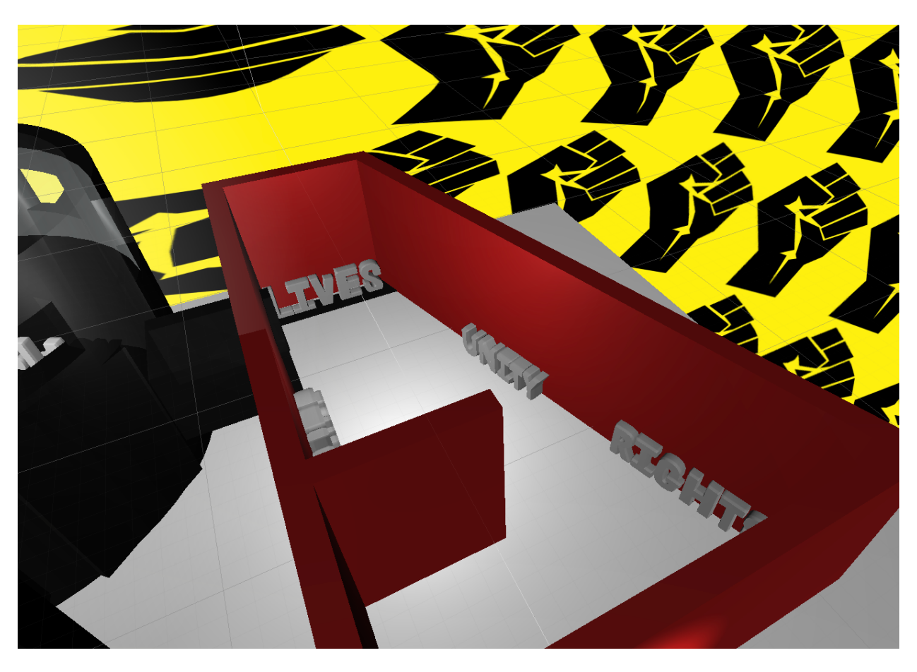
This image of the second room shows the value words have to Black Lives Matter.