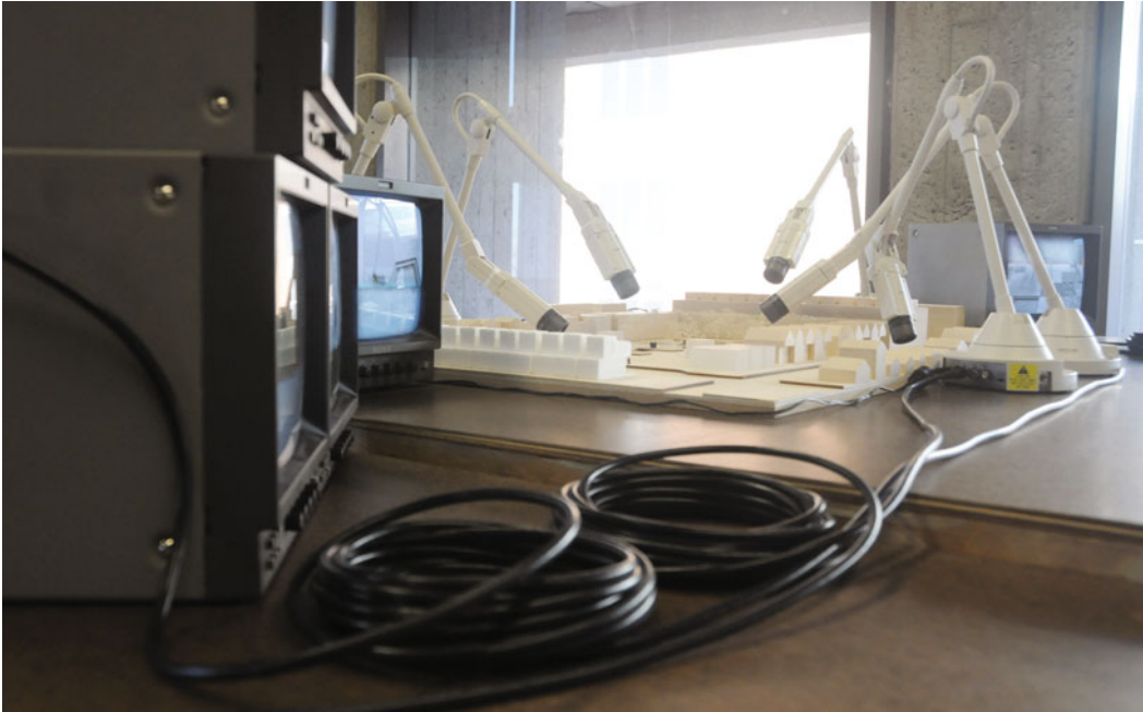
Speculatorum Oculi