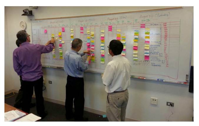
Figure 2. Committee scheduling a conference using sticky notes and a whiteboard. The organizer in the blue shirt has been delegated to re-tape fallen sticky notes.

The interview established who the users of the system would be and how often the system would be used, a prioritized list of the main tasks performed by users, the data sources and flow of data, and non-functional requirements such as scalability to different screen sizes and support for local and remote collaboration.