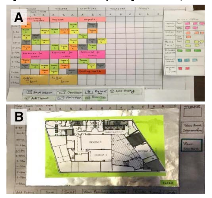
Figure 3. Sketch prototypes for StickySchedule. Panel A displays the main scheduling calendar interface. Panel B shows the conference floor plan as an example of the supplemental information provided to organizers.

Environment . By selecting SAGE2 as a platform to develop our StickySchedule application, we were able to satisfy our two highest priority requirements: providing multi-user functionality and enabling the application to scale to ultra high resolutions. Additionally, using SAGE2 helped us