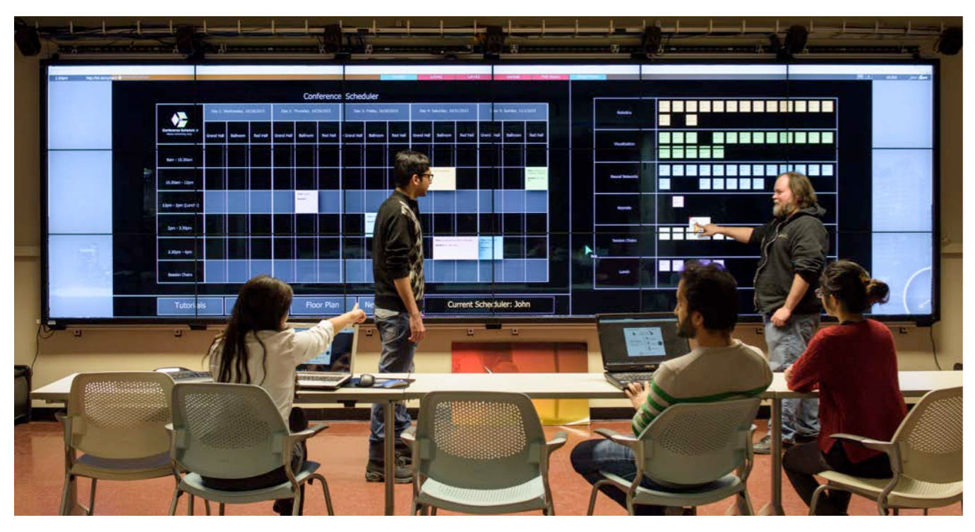
Figure 1. Simulated organization committee scheduling a conference using StickySchedule. Interaction is supported from both personal devices (e.g. a mouse from one's laptop) and touch directly on the large-scale shared display

from novice users and authentic use cases with expert feedback from experienced organizers, we show that StickySchedule (which supports direct touch interaction on the large-scale shared display, distant interaction with mouse pointers, and remote collaboration between multiple shared displays) more completely meets the requirements associated with large conference scheduling tasks. Figure 1 illustrates the use of StickySchedule by a collocated team of organizers.