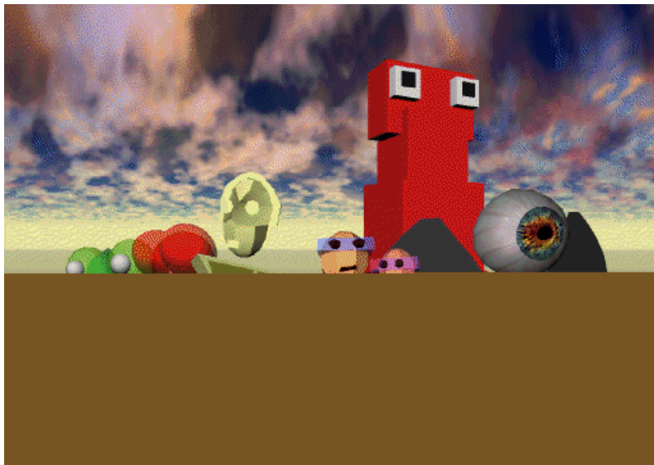
Figure 3: A selection of CALVIN's avatars.

Although the avatars shown in figure 3 may seem more appropriate in a child's learning environment rather than a professional design tool, we believe nevertheless that it is important to provide significantly contrasting avatar representations, and to provide avatars that give sufficient cues for viewers to discern the direction the avatar is facing. In real life we identify people at a distance by their gait, their height, their complexion, or the color of their hair. In a virtual world gait is difficult to distinguish since avatars tend to glide across the landscape. If every avatar were uniformly designed (e.g. a cube with a texture-mapped face on all sides) they would be difficult to distinguish from one another at greater distances. Instead, by providing avatars with obvious fronts and backs, participants may communicate notions of relative position to one another with phrases such as "it is behind you," or "turn to your left."