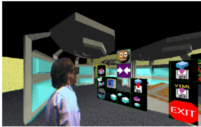
Figure 5: The Virtual Visor and its InYerFace.

moved, the targeting cursor instantaneously follows. To make a selection the user aims the cursor at a selectable visor item (simply by looking at it) and presses a button on the wand.