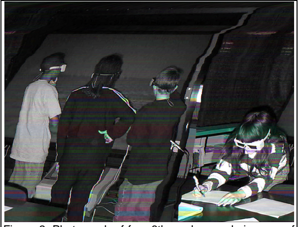
Figure 2: Photograph of four 6th graders exploring one of the virtual ambient environments to collect data. The children rotate through the roles of navigator, spotters, and note taker. Afterwards, they will then return to their classroom and integrate their data with the data of other groups

The teachers request these models and tell us what features we should emphasize. We then build the virtual models and make them available at the school. Several of the QuickWorlds that we have made on request from the teachers are shown in Figure 1. We wanted this track to require a minimal commitment from the teacher. It focuses on the ImmersaDesk as just another presentation medium for the teachers to use, and we are interested in observing how they use it.