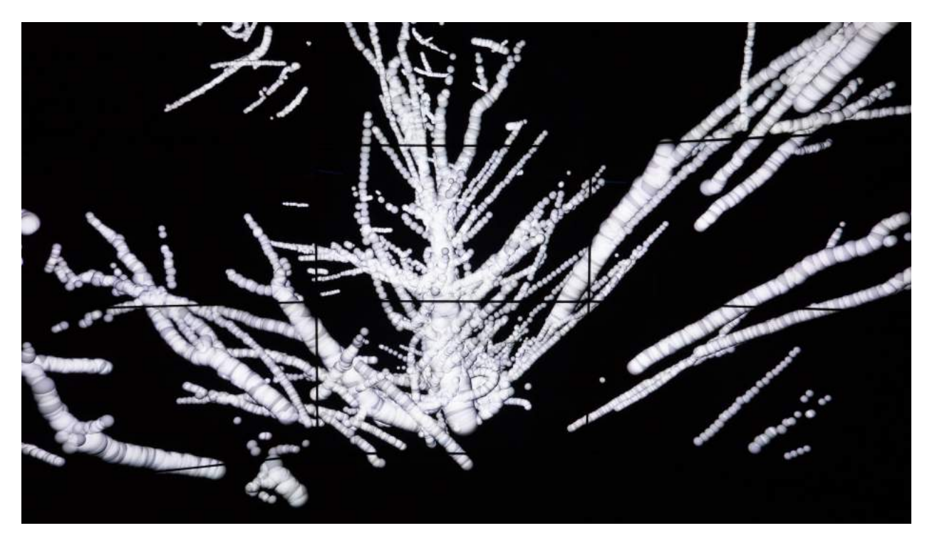
Figure 3: Timelapse visualization of halo merge trees. A group of visitors noted that some halos evolve in parallel and dissipate.