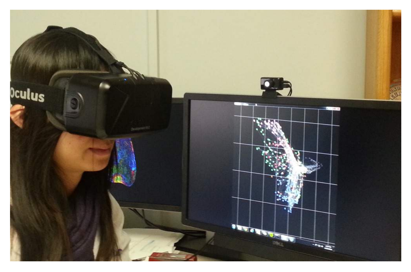
Figure 5: A researcher interactively explores the intrinsic geometry of the human brain connectome in 3D using the BRAINtrinsic application created at EVL.

ence Poster Compendium, Electronic Imaging'16, 2016.