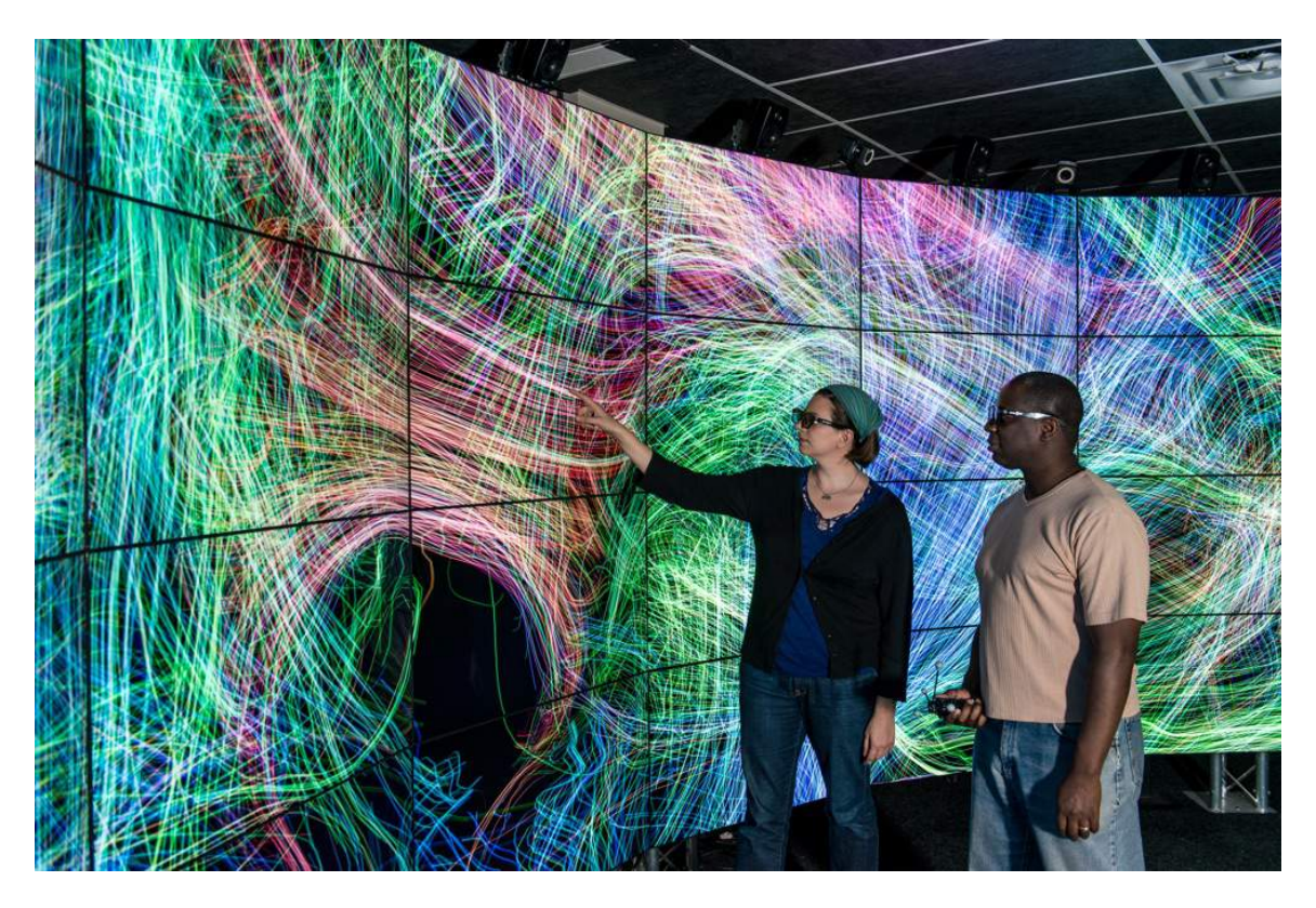
Figure 4: UIC graduate students explore a representation of connectome data in 3D using CAVE2.

further necessary to be able to quickly reconfigure tables and chairs, and the users should feel comfortable working in the space for 8+ hours straight.