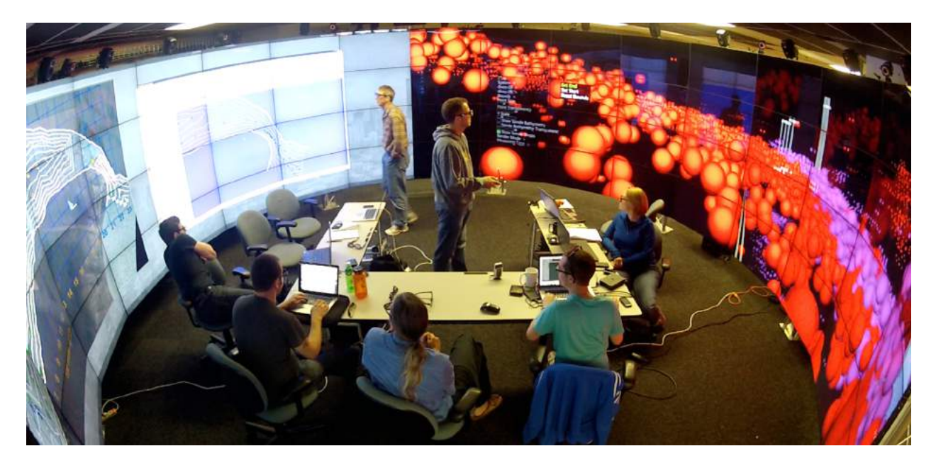
Figure 1: The ENDURANCE team examines lake data in CAVE2.

The ENDURANCE team spent two days working in CAVE2, allowing us to see how a multi-disciplinary team can work in an Immersive Analytics environment. During the meeting, team members sat at tables inside CAVE2 with their laptops. Different members of the team had different responsibilities and different expertise, and had brought their local data with them. The walls of CAVE2 were used for shared representations. Detailed data was kept private until is was needed and then users could easily share their screen or drag and drop a relevant data file to the wall to add to the current conversation. The goal was to quickly answer questions about the data that had been collected and the processing that had been done on it.