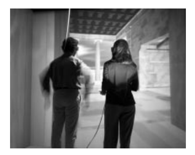
Figure 1: Miletus in the ReaCTor

Foundation of the Hellenic World Athens, Greece