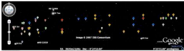
Figure 2. Traditional annotations in Google Sky. The picture contains only about 60 annotations, yet the information is almost illegible.

The client receives the images, cross-registers them, computes the pixel-based overlay and displays it. The cross-registration and overlay operation involves projecting each image from a rectangular grid onto the sky, zooming in and out to account for telescope parameters, changing transparency etc. The visualization is accomplished using WebGL -- a web standard that provides a 3D graphics API implemented in a web browser without the use of plug-ins [2]. The client finally renders the scene to an HTML Canvas element, where the visualization scenegraph consists of a sphere with the camera at the center looking out.