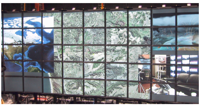
Figure 1. SAGE running on a 55-tile display in San Diego with applications streamed from Amsterdam and Chicago (iGrid 2005).