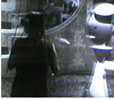
Figure 2. An avatar pointing to the door and a receiver looking into the direction.

the opportunity to move the object to newly prescribed location. Finally, one user used the playback to confirm what he did to the environment. The users used two kinds of relative standing positions to the messenger avatar. While the avatar was talking to the user, the user stood in front of the avatar. When the messenger avatar started explaining how to move objects, the user stood next to the avatar so that he/she could see the same object from the same view point. These two modes are also seen in daily life and are very natural behavior. The users treated the messenger avatars as if their collaborators were actually present in the collaboration. Inadvertently collaborators would find themselves talking to the messenger avatar.