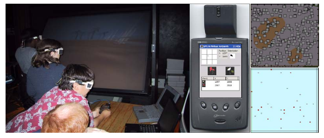
Figure 3 . The MyField study. Left image showing two children navigating the Field, while another child looks at the simulated GPS and trace view. Right image shows the simulated GPS on a PDA, trace view, and the MyWorld screen showing the found plants.

In earlier studies, the use of paper and pencil (and insufficient attention to planning data collection forms) contributed to the loss of data [8]. Sometimes students forgot to record plants that they had found. They often got confused between two red flowers—roses and tulips—and made mistakes while recording. The Field provided a way to mark the found plants—placing flags—to prevent duplicated counting. However, students simply forgot to place flags or placed them too far from the plant they were intended to mark, which caused duplicated data. In the