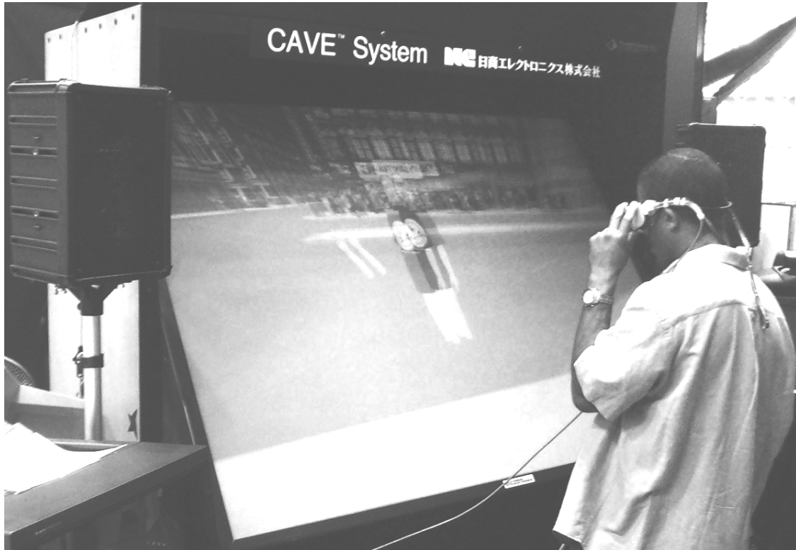
Figure 4. Virtual Harlem on the ImmersaDesk at iGrid

The goal of the Harlem project is to provide an environment that contextualizes the study of the Harlem Renaissance, an important period in African American literary history, through the construction of a virtual reality scenario that represents Harlem, New York, as it existed circa 1925-35. Networked students can navigate through the streets and buildings of Harlem, and see the shops, homes, theaters, churches, and businesses that the writers of the period experienced in their everyday lives. Students can enter the Cotton Club and listen to African American entertainers like Fats Waller or Duke Ellington. They can experience the fact that while the entertainers and servers were African American, the clientele was white. In Virtual Harlem, students can hear the music of the time, watch the dances of the period, and even listen to political speeches of figures like Marcus Garvey or enjoy a poetry reading by Langston Hughes. An instructor at one site can lead students through the environment, explaining things and answering questions, and students can present their own research.