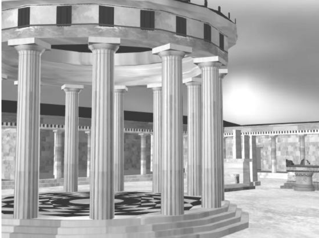
Figure 3. The Delfinio of Miletus

The objective of the Shared Miletus application was to take the content that would normally be shown in the controlled environment of FHW's museum, and let remote, networked people visit it. In particular, we did not want to simply make it something like a VRML model that visitors would download and then play with on their own; instead, it was to be a dynamically shared world, "hosted" by the conference demonstrators.