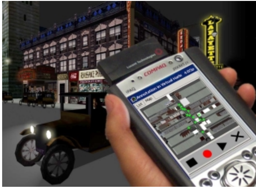
Figure 3. Using the PocketPC interface the user can see all of the annotations in the space. The list view shows who made the annotation and when it was made. The map view shows the locations of all the annotations.

environment by specifying a database file. The tool records the user's gesture and voice into separate files with headers that include the author's name, the annotation's name, and the location of the annotation in the virtual environment. Thus, it allows users to query the list of annotations by the author's name, region, or date.