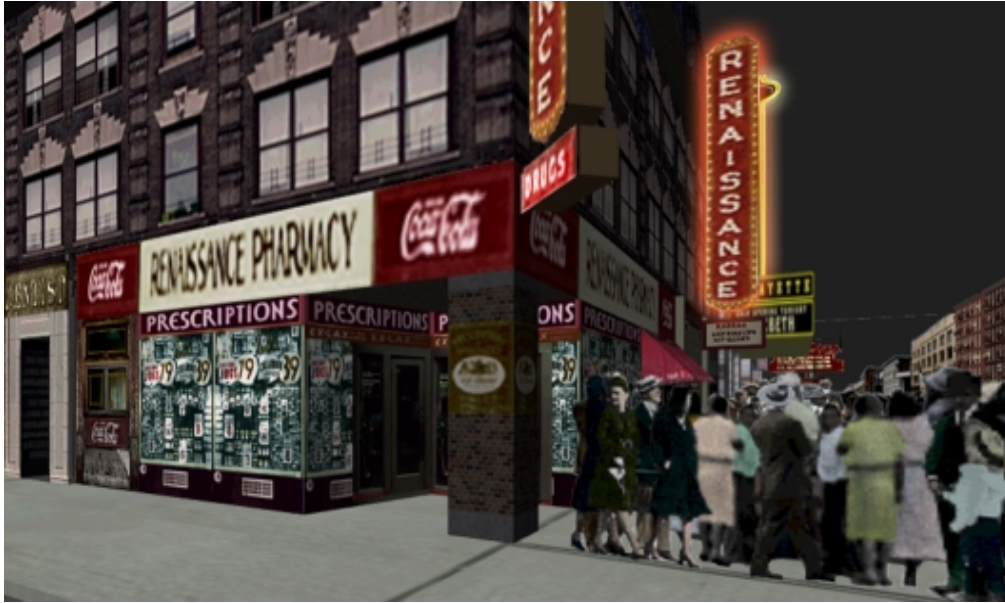
Figure 1. Virtual Harlem allows students to walk through the streets of Harlem in the 20s and learn more about the context of the literature they are studying.

Harlem in an English literature course. The goal of the broader study was to explore how VR could be used to enhance traditional learning technologies such as books, videotapes, CDs etc, in the classroom. In the interest of brevity, this paper will focus only on the students' experiences with Virtual Harlem.