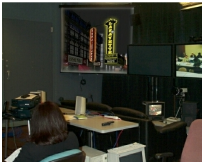
Figure 4. The AGAVE system allows us to bring Virtual Harlem into the classroom using passive polarized stereo visuals driven by a Linux PC. The screen on the right shows a video conference with the remote classroom.

their two dimensional Access Grid content – the Access Grid was designed primarily for multi-site video conferencing. With AGAVE, students wear inexpensive ($0.30 to $12) 3D movie glasses to view the immersive content. If desired an additional 3D tracking system and pointing device can be incorporated to support 3D interaction. In this study we used a regular joystick. Figure 4 shows Virtual Harlem running on AGAVE. To the right of the AGAVE are plasma display screens of the Access Grid. On the rightmost screen is a video stream from the classroom at CMSU.