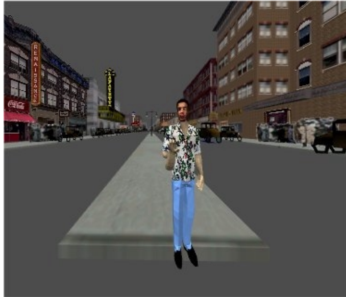
Figure 2. When an annotation is played back in Virtual Harlem as avatar speaks and gestures just as the recorder of the annotation previously did.

attached to them. Individual node classes are compiled into dynamically shared objects (DSOs), so that they can be rapidly added to a world or modified. The system includes a number of pre-made classes that implement common capabilities in VR, such as audio playback, avatars, navigation controls, and triggers that detect when a user enters an area.